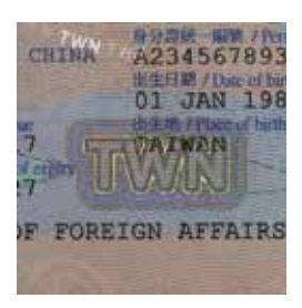
The 'pumping' effect