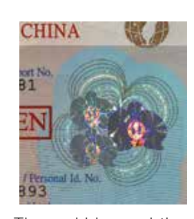
The orchides and the butterflies

Most notably, one of three orchid images in the top right of the data page is realized in Surface Relief Effect, making the leaves appear to protrude from the plane and seemingly tactile, while in fact being completely flat. The two orchids to the left of it appear semi-transparent. The shape below these orchids is equally semi-transparent, but realized as lens effect, enveloping the secondary image. It likewise appears to protrude out of the reference plane. To the left of the secondary image, a colourful pump