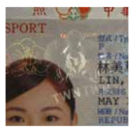
Coloured and colourless transparent effects

effect in the contours of the letters "TWN" can be observed. The contour lines seem to enlarge and contract as the passport is tilted, this effect is referred to as "pumping". By reversing the direction of tilting, the apparent movement will be reversed accordingly. Above this area, a line of small letters "TWN" is realized in a colourless dynamic matte effect, and the text seems to move right or left when the passport is tilted about the vertical axis. The letters "TWN" can be seen in different levels of grey, without any colour, and appear to dynamically and dramatically change their gray color.